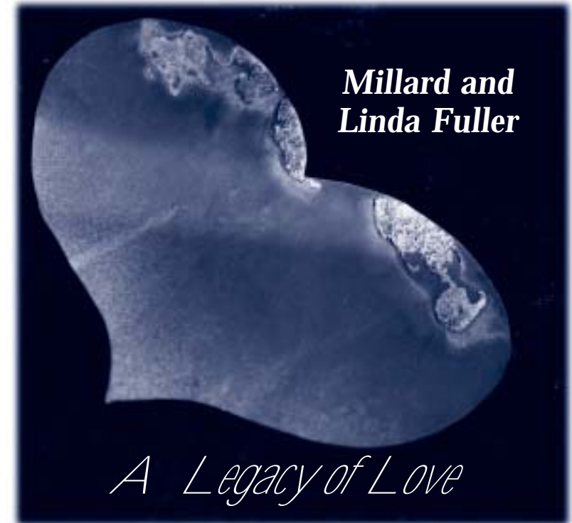
Millard and Linda Fuller